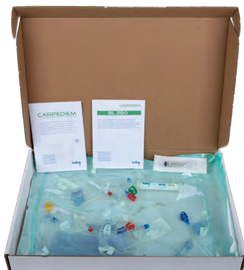
Figure 1. BL 250 KIT 015 CVVH / CVVHD for Carpediem™ system, as example

The 10 mL Luer Lok™* BD Plastipak syringe is sterile, single use and inserted with its primary packaging in the procedure pack.