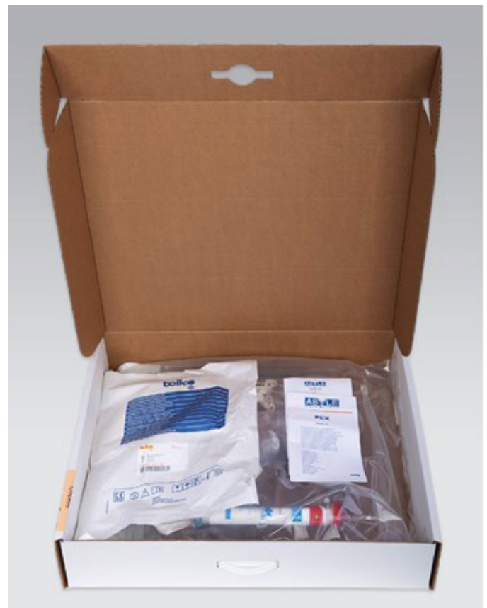
Figure 1. PEX Procedure Pack for the Amplya™ machine

The 5 litre drainage bags are included in the procedure pack for the purpose of collecting waste fluids and they belong to Class I medical devices.